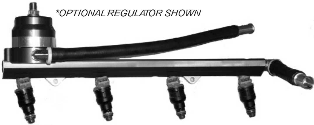
PASSENGER SIDE RAIL ASSEMBLED