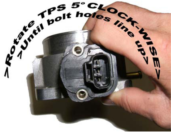
Rotate TPS to align bolt holes