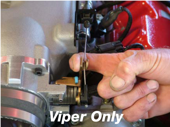
Slightly bend bracket by hand to align cable