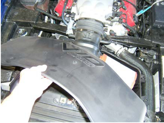
Remove air box lid