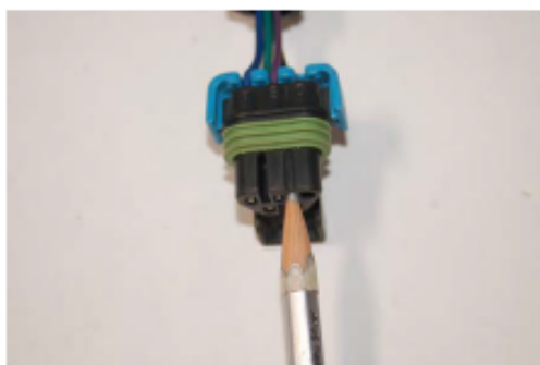
Open this slot up

On the male connector of the provided extension wires, the plastic needs to be trimmed out of the other slot as shown in the pictures. Use a sharp knife to carefully trim out the plastic to open the slot. Also make this modification to the O2 sensor plug.