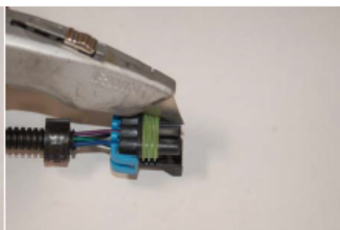
Using a sharp knife