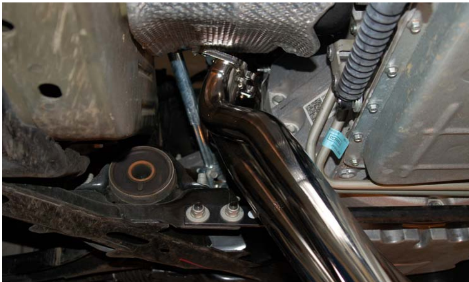
FIG. 2 BBK header will slip right in place around steering shaft and motor mount.