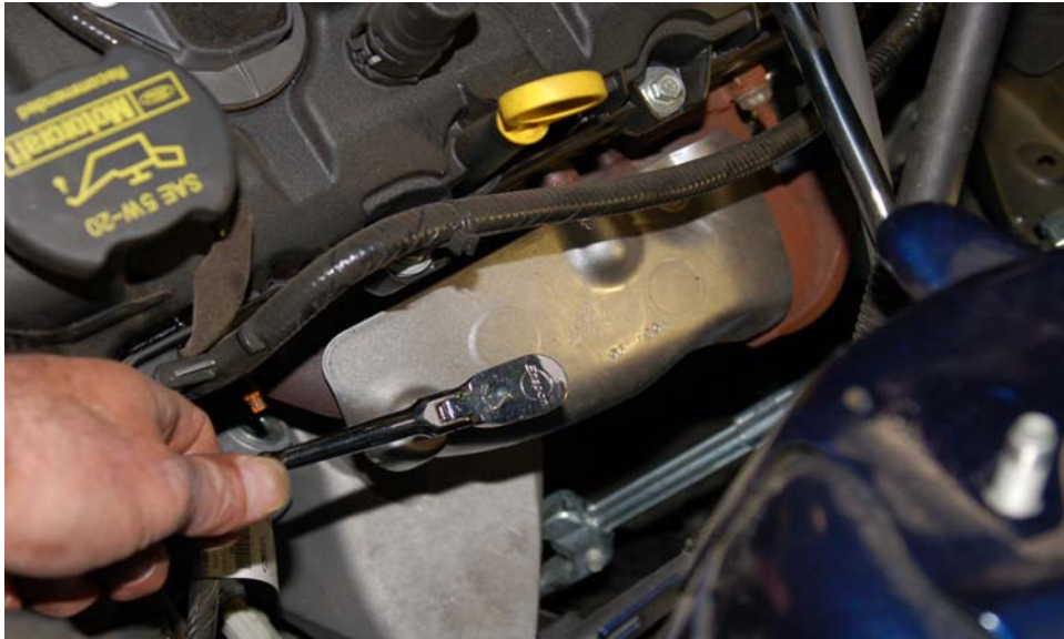
FIG.1 Remove heat shields