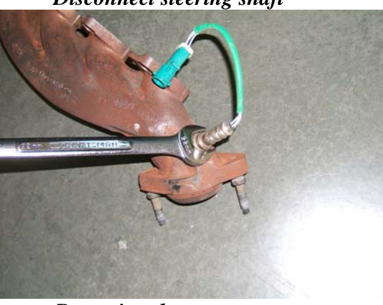
Removing the oxygen sensor