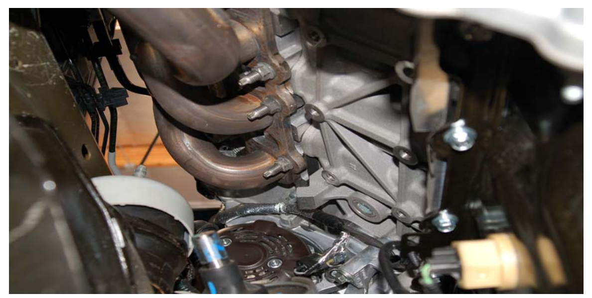
Fig 1. Motor Mount removed. Shows nut access.