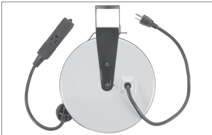
Electrical Rating - All models use 125 Volts 60 Hz

CAUTION - TO REDUCE THE RISK OF ELECTRIC SHOCK AND FIRE - PULL PLUG WHEN SERVICING, OR WHEN RE-LAMPING - USE ONLY 13 WATT OR SMALLER BULB