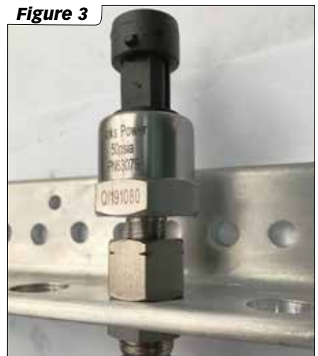
Fig 3: Bracket Mount Reference