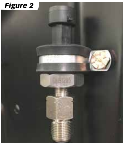
Fig 2: P-Clamp Mount Reference