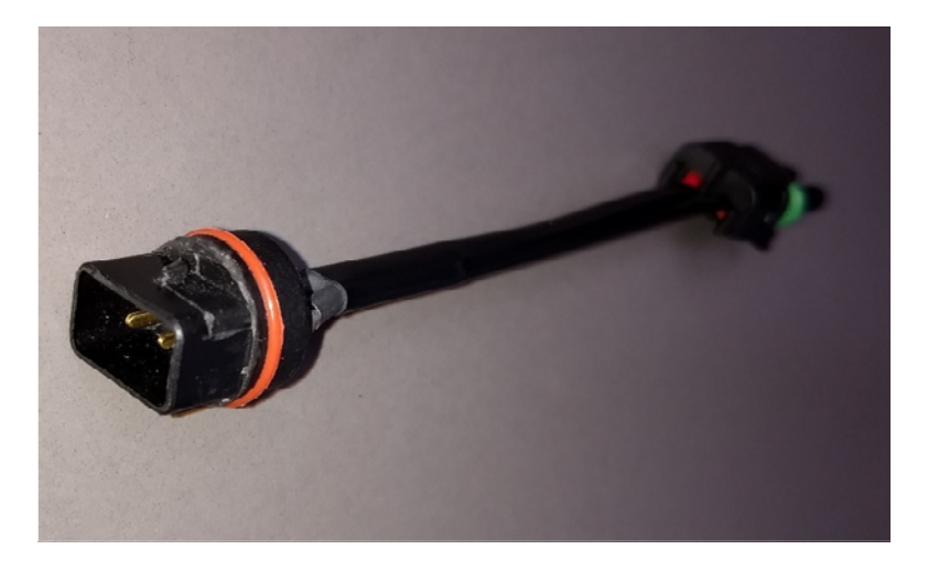
Step 6: Turn on fog lights with the factory switch and adjust to the preferred location down-road.