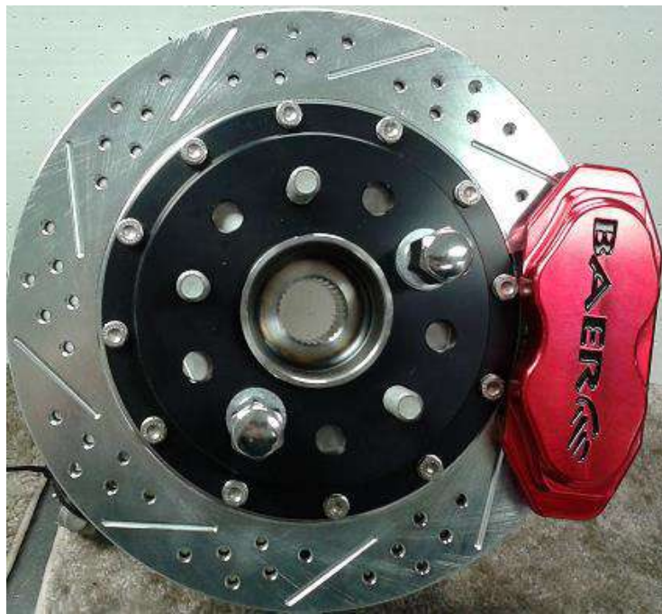
Figure: Completed install

8. Repeat these steps for the other side and recheck all attachment points and fittings.