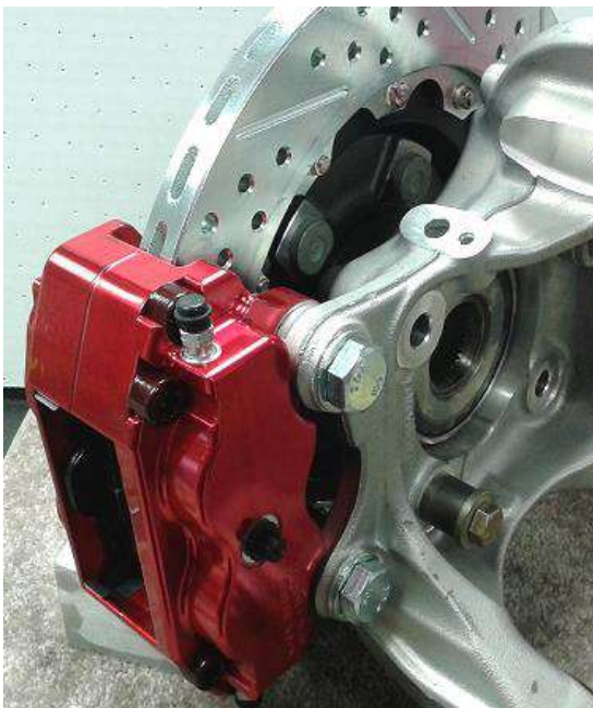
Figure 1: Caliper installed (inboard view)