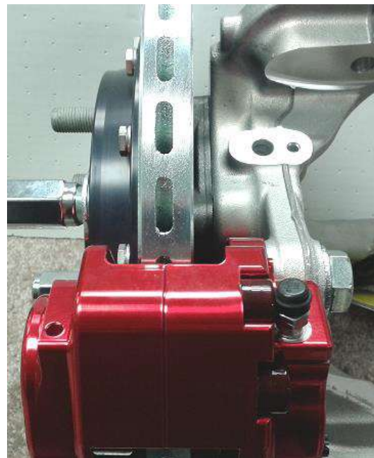
Figure 2: Caliper installed (side view)