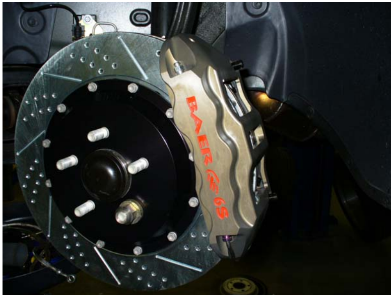
Left side shown

For service components, please consult your Baer Brake Systems Tech representative.