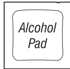
Alcohol Pad x2