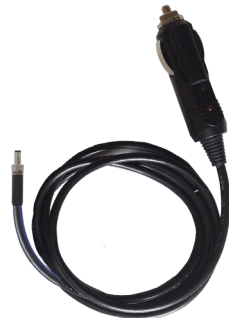
SPS-12 Optional Cigar Lighter Cable (Model AC-75 sold separately)