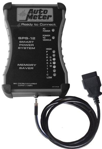
SPS-12 OBDII Cable