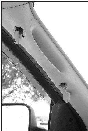
Dodge Ram Shown (Photo 1)