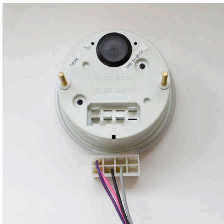
Electric Speedo with lower row terminals