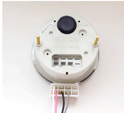
Tachometer with lower row terminals

At this point you should have the following wires left over. Here is where they go. We will address the existing gray wires last.