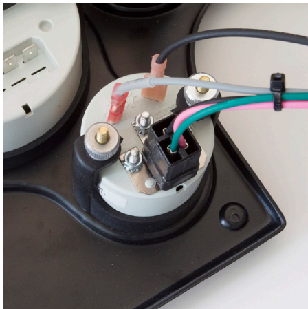
Light Socket Wiring