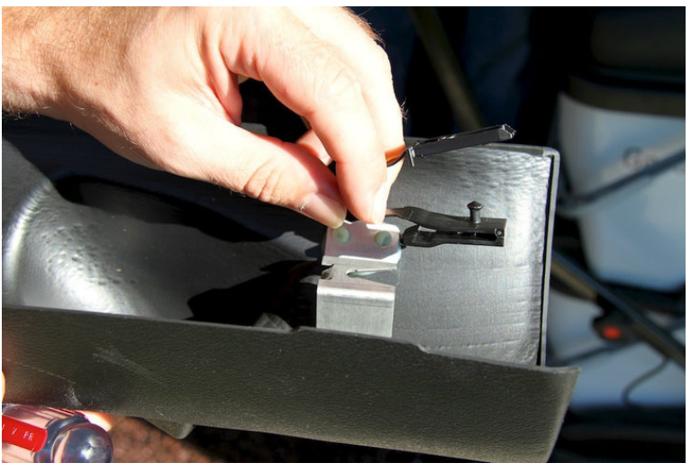
6. It's then re-installed into the new pillar the exact same way.

5. The safety strap is then removed from the factory pillar. The tab on the back is depressed and it slides right out.