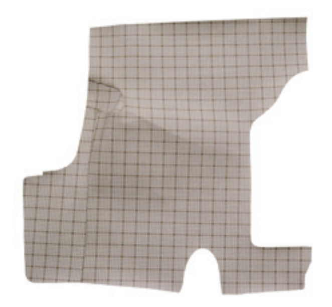
(additional pattern choices available on our website)