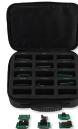
EXPANDED KEY PROGRAMMING ACCESSORIES