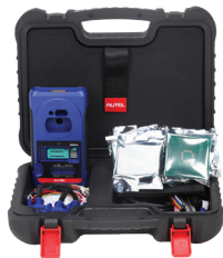
ADVANCED ALL-IN-ONE KEY PROGRAMMER

ADD EUROPEAN VEHICLE COVERAGE TO YOUR IM508 OR IM608 WITH THE XP400PRO