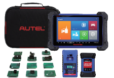
MaxiIM IM608PROKPA Only Sold in North America