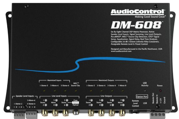
DM-608 Six by Eight Channel DSP Matrix Processor