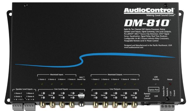
DM-810 Eight by Ten Channel DSP Matrix Processor