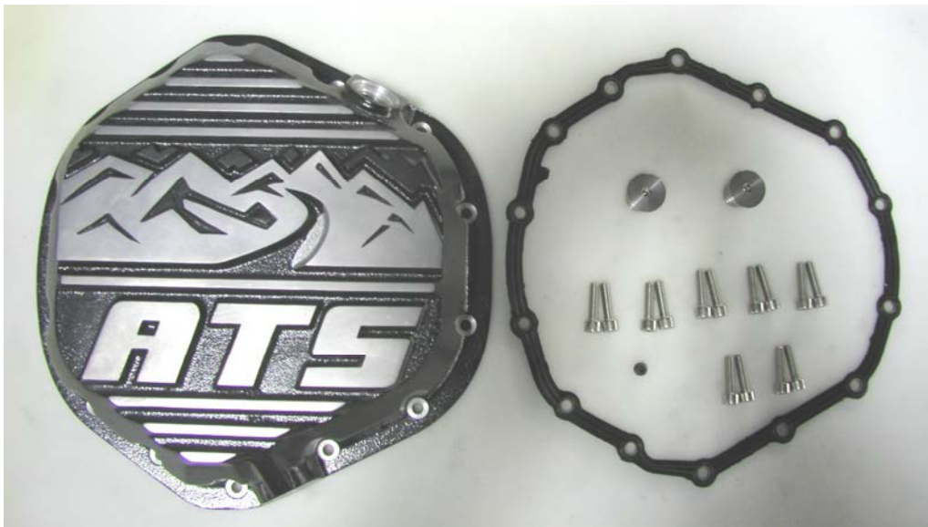
Figure 1: GM/Dodge ATS Protector Differential Cover Kit

For some installations, removing the spare tire may provide better access to the work area. It is not necessary in every case. The installer should determine if there is adequate workspace prior to starting the installation.