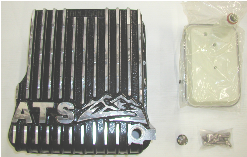
Figure 1: Allison High Capacity Transmission Pan

If transmission temperatures run too high, consider ATS Transmission Coolers, Thermostats and Transmission Temperature Gauges for transmission temperature control and monitoring.