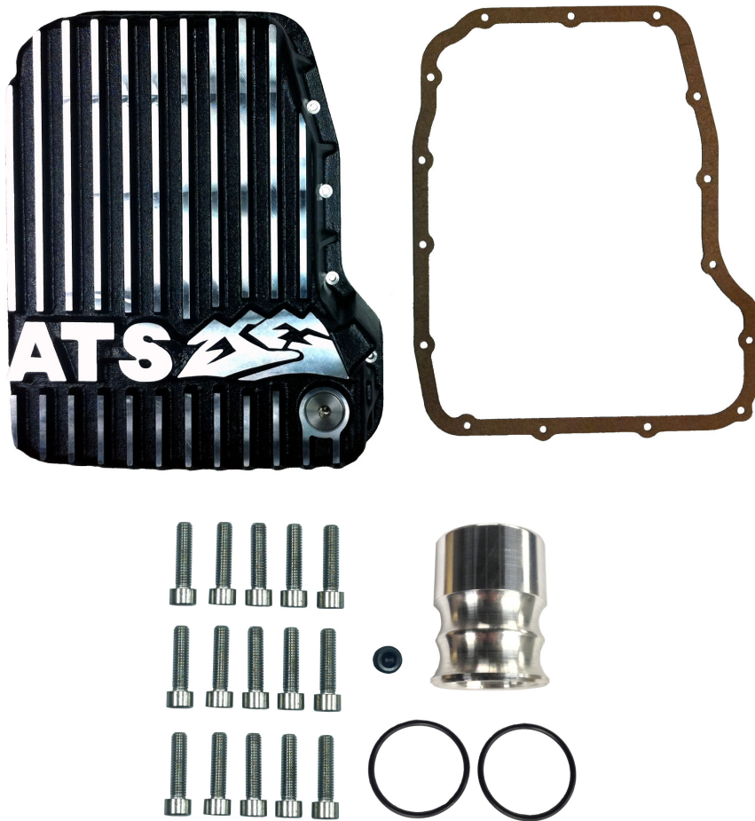
Figure 1 - 68-RFE Deep Pan Kit Contents

Please read all instructions before installation.