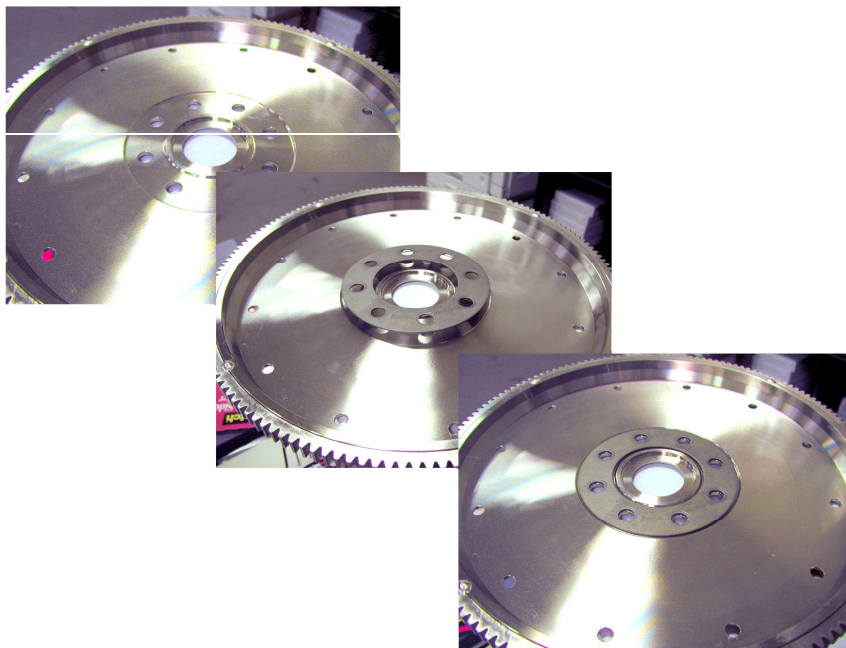
Figure 1: Reuse of the Factory Spacer