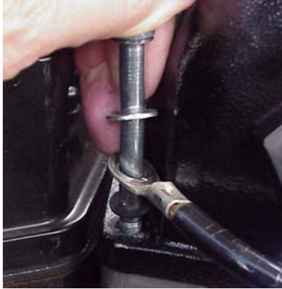
Figure 3 - Installing Ground Wire, Note Rubber Washer Below Ring Terminal