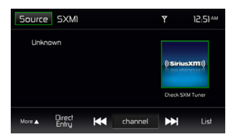
(SiriusXM® Menu page 1)

The on-screen indicators and touch key areas for SiriusXM® functions are outlined right.