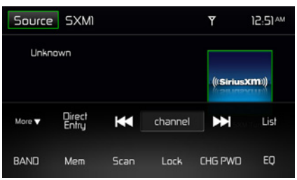
(SiriusXM® Menu page 2)

List Icon - Touch to select a channel search criteria. Presets lists preset channels stored by the user. Channels lists all SXM channels. Category lists SXM channels by categories.