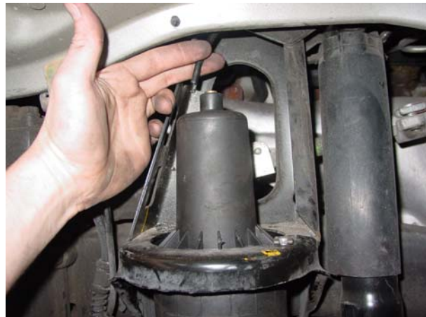
4. Depressurize air spring by removing nylon air hose. To remove air hose, push down on the metal collet, while pulling out on the hose. ↑