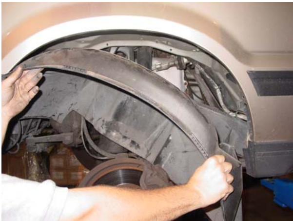
3. Remove plastic wheel arch liner. ↑