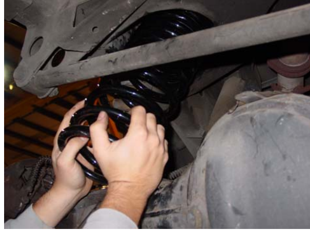
8. Install coil spring onto rear suspension. ↑ Align the upper aluminum spring mount in place.