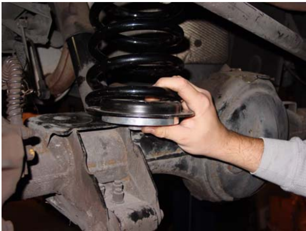
9. Hold the coil spring against the upper mount, while sliding lower spring perch into place. ↑

10. Using a floor jack, jack up the axle, compressing coil springs so you can replace lower shock retaining nuts