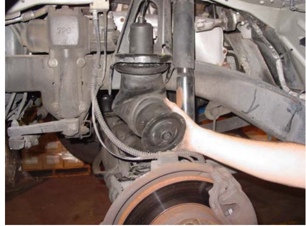
8. Remove and discard old air spring. ↑