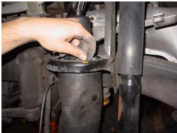
5. Remove the two upper securing clips. ↑