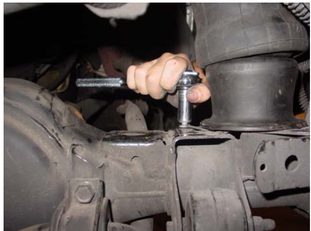
6. Remove the bolt securing the lower air spring retaining pin to the front axle. ↑