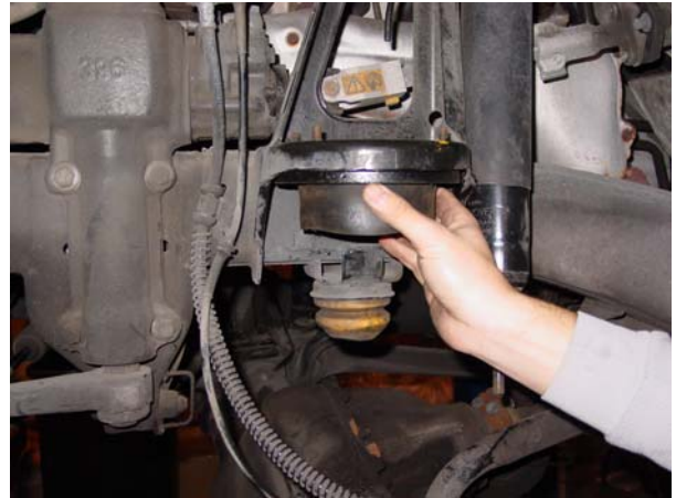
10. Install upper coil spring rubber isolator. ↑