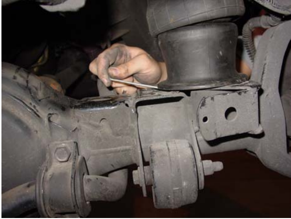
7. Remove lower air spring retaining pin. ↑