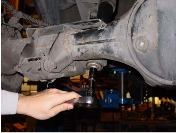
7. Remove retaining nuts from both rear shocks.