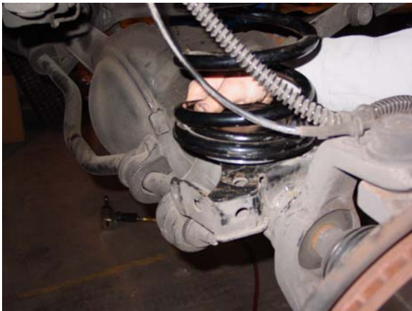
11. Install front coil spring onto the suspension. Hold the coil spring against the upper mount, while sliding lower spring perch into place. ↑

12. Using a floor jack, jack up the axle, compressing the front coil springs so you can replace lower shock nuts. (Reverse step #9) REPLACE FRONT WHEELS