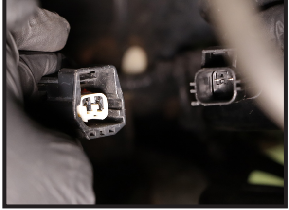
FIGURE 2 FIGURE 3

3. UNCLIP AND UNROUTE THE SHOCK ELECTRICAL LINE. (FIGURES 4, 5)