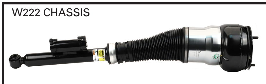
THIS IS NORMAL (AS-3360, AS-3361, AS-3366, AS-3367 )

Arnott® is committed to the quality of its products. If you have a question or problem with any Arnott product, please contact Arnott by calling 800-251-8993 during normal business hours or email techassistance@arnottinc.com . (In the EU please call +31 (0)73 7850 580 or email info@arnotteurope.com )