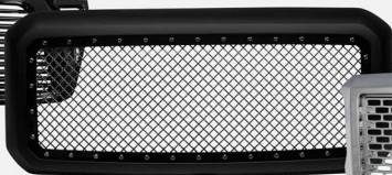
Rivet Mesh Style