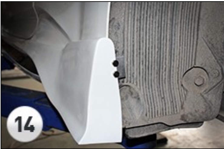
13. After putting the mounting brackets on, bolt the rear side of the side skirt to the wheel well (Figure 14)