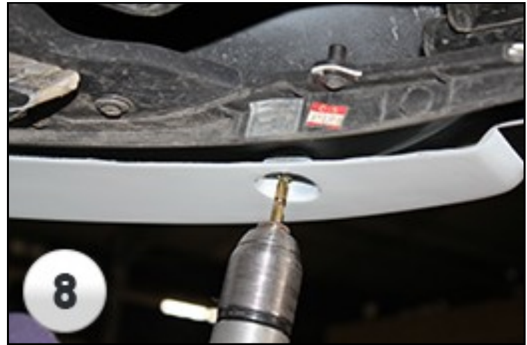
8. Drill holes through the dimples on the lip (Figure 8)