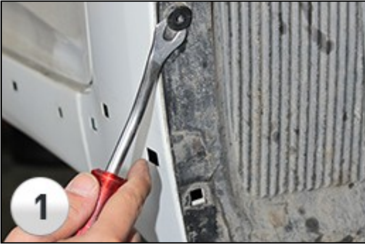
1. Remove OEM clip in rear wheel well (Figure 1)