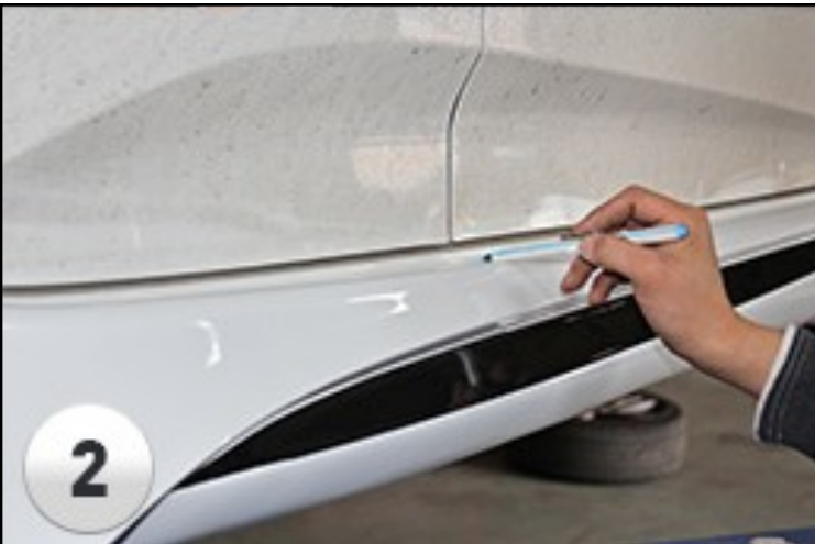
2. Align side skirt to body line and mark with a washable marker or preferably painters tape (Figure 2)