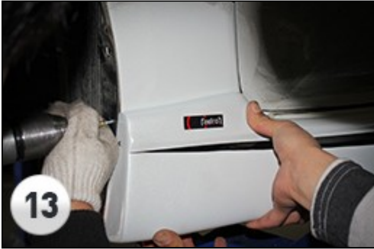
12. Drill the second hole in the wheel well (Figure 13)