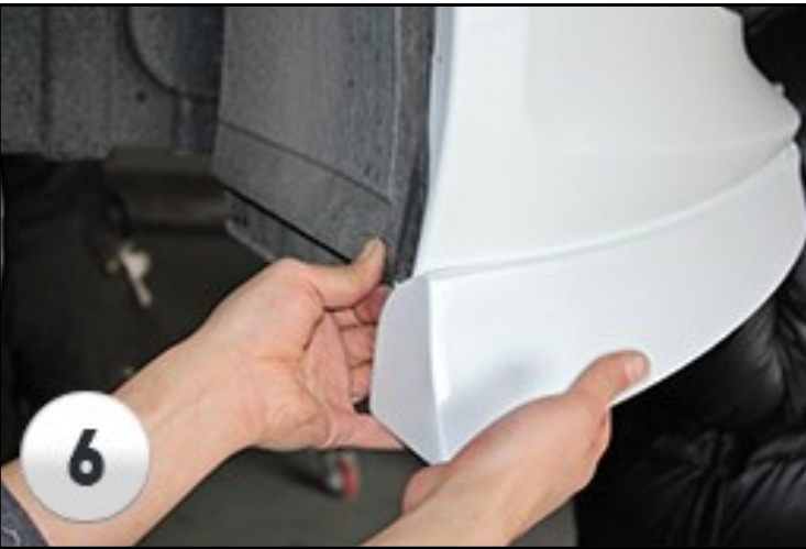
6. Double check to make sure everything fits properly (Figure 6)