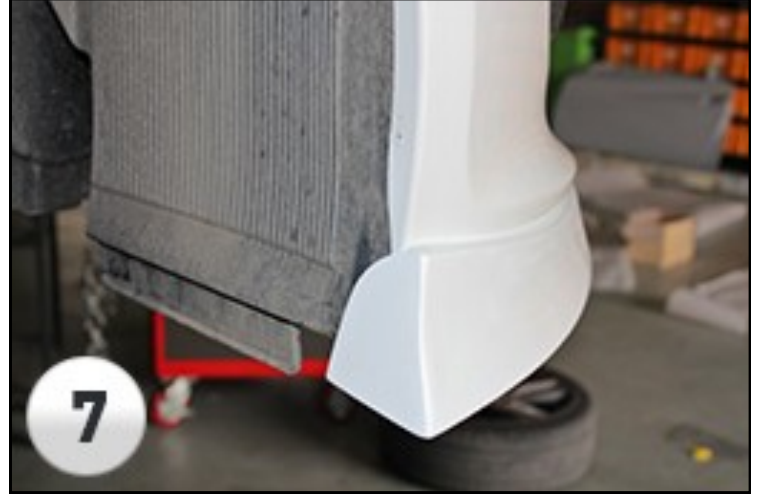
7. It will be a tight fit once it's put on (Figure 7)