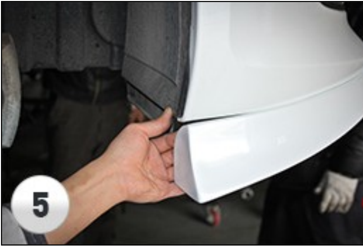
5. Line up the lip with the bumper before pulling it over the edge (Figure 5)