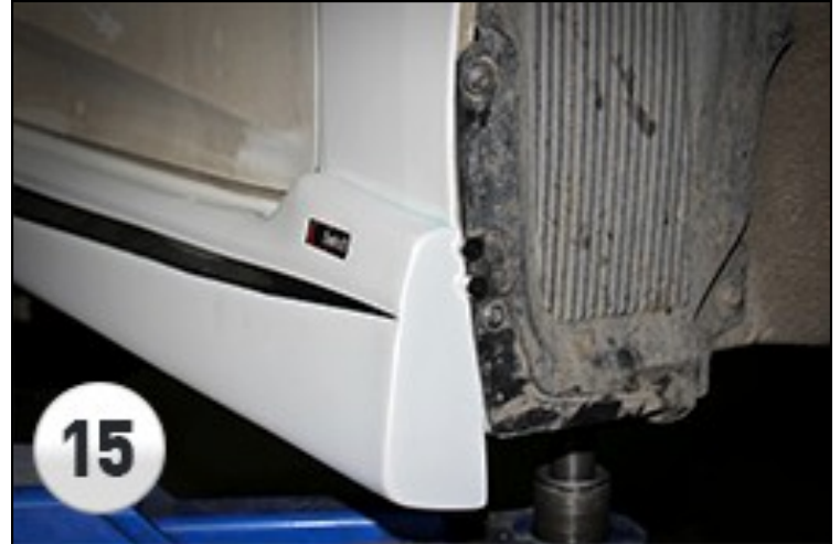
14. Bolt the front side of the side skirt with the supplied hardware (Figure 15)