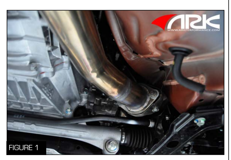
Optional Part: (1, 2, & 4):

1. Optional part: Bolt the resonated test pipe to the OEM catalytic converter with the OEM flange gasket and nuts using a 17 mm socket wrench (Figure 1)