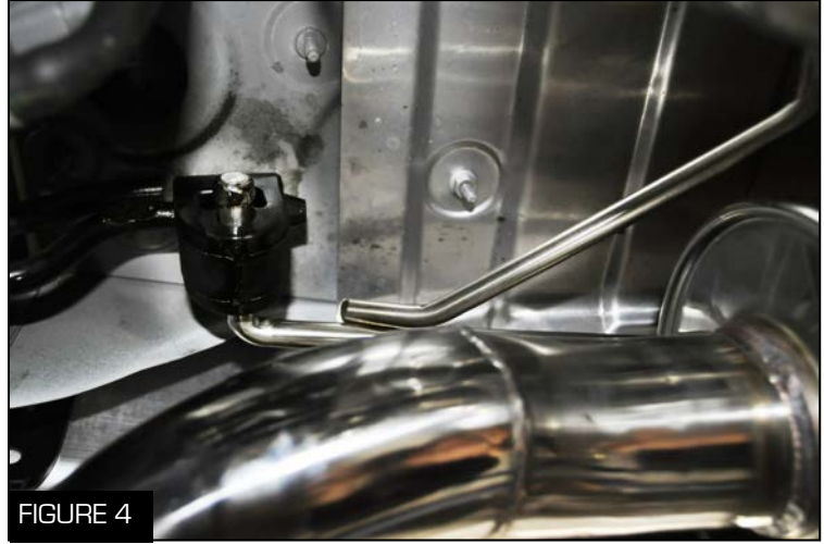
4. Spray the metal hangers and rubber insulators on the mufflers with a lubricant and slide the metal hangers into the rubber insulators towards the back of the vehicle (Figure 4)