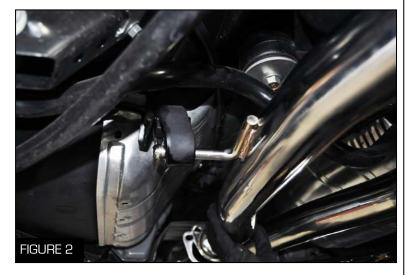
2. Spray the metal hangers and rubber insulators on the mid pipes with a lubricant and slide the hanger into the insulator (Figure 2)