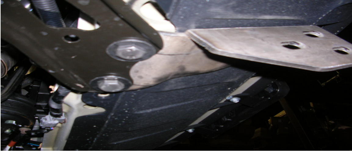
Diagram number 2. Brace bracket location