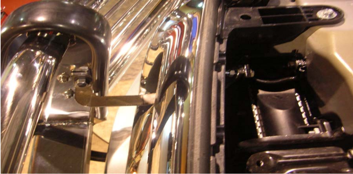
Diagram number 4. Brace bracket installed through grill opening