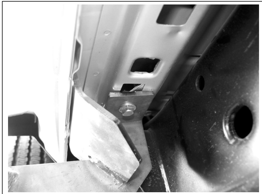
Fig 5 driver side front bracket shown