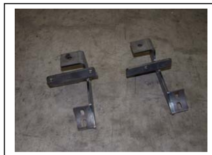
Fig 2 Driver side brackets