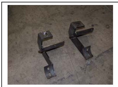
Fig 1 Passenger side brackets