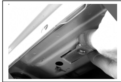
Fig 4 Driver side front shown