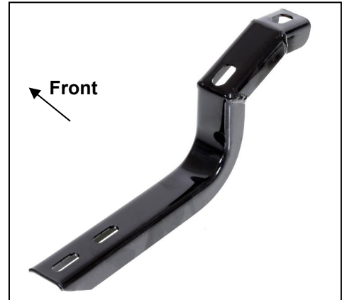
(Fig 2) Driver/Left Front Mounting Bracket

There are four sets of threaded holes in the side panel. Starting from the front of the vehicle, use the first, second, and fourth set of holes.