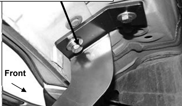
(Fig 3) Driver/Left Front Mounting Location Pictured(Example Only)