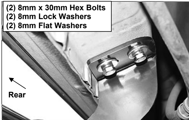
(Fig 7) Driver/Left Rear Bracket Pictured(Example Only)

There are four sets of threaded holes in the side panel. Starting from the front of the vehicle, use the first, second, and fourth set of holes.