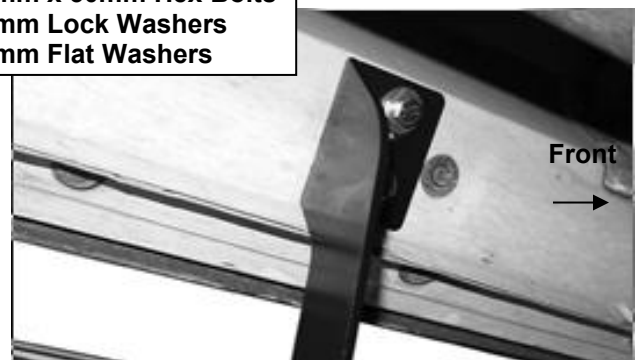
(Fig 6) Driver/Left center Bracket installed(Example Only)