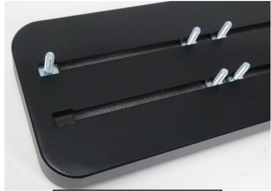
(Fig 8) Slip M6 T-bolts into the bottom channel

(2)M6 T-bolts (2)M6 Flat Washers (2)M6 Nylon Lock nuts