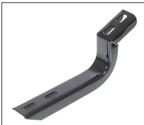
(Fig 5) Driver /Left center Bracket