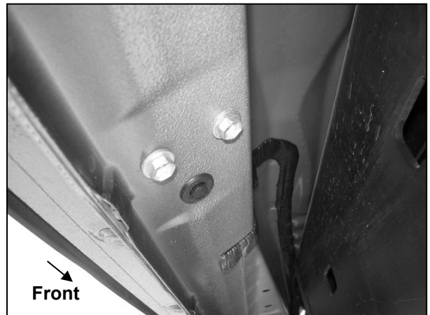
(Fig 4) Driver/Left Center mounting location