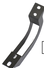
Middle & Rear Bracket