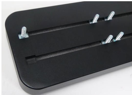
(Fig 2) Slip M6 T-bolts into the bottom channel