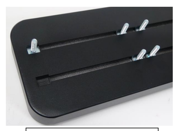
(Fig 2) Slip M6 T-bolts into the bottom channel