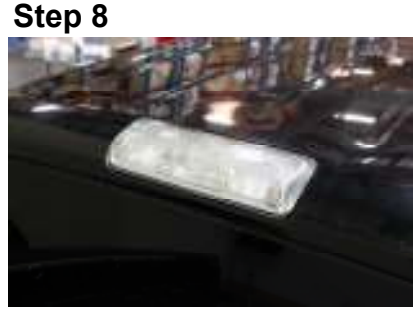
Install the Anzo third brake light by reversing step 2