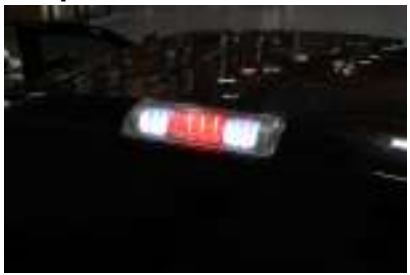
Be sure to test all functions before operating the vehicle