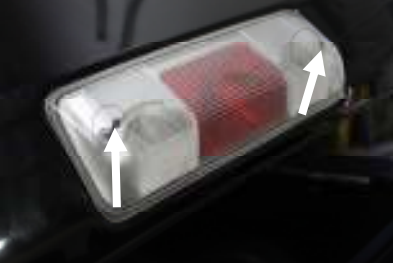
Remove the two phillip screws