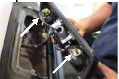
Insert the reverse light bulb sockets into the Anzo third brake light housing