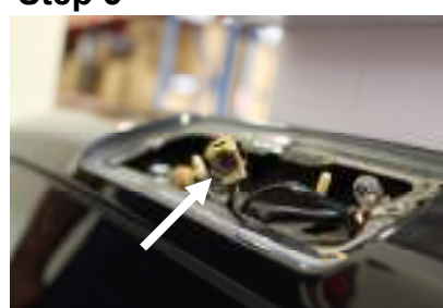
Remove the brake light bulb out of its socket