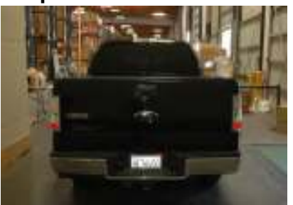
Tools needed: Phillip Screw Driver