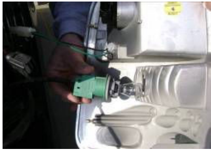
Step 6: Install the green socket into the ANZO taillight assembly.