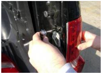
Step 9: Install the taillight in to the housing of the truck using the two 8mm. Screws.