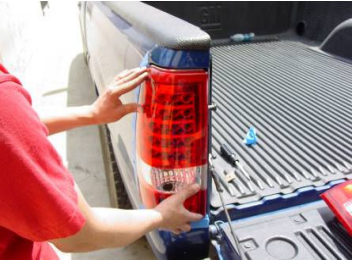
Step 9: Place the LED taillight into the truck housing, secure with screws.