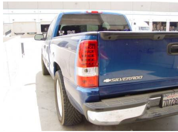
Make sure all functions are working properly before driving.