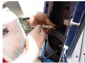
Step 8: Connect the resistor to the taillight housing.