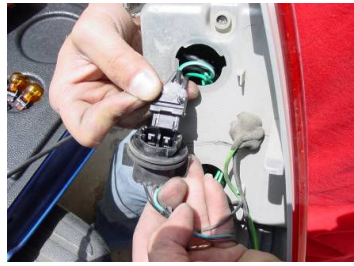
Make sure the wires match: Black to Black