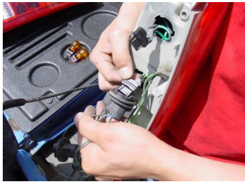
Step 7: Connect the pigtails to the stock sockets.