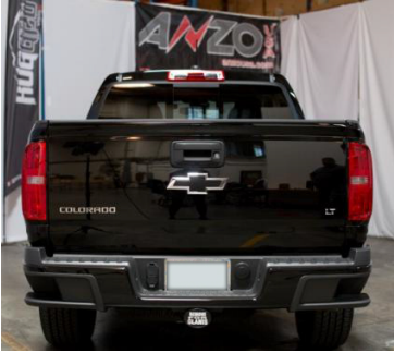
Original 3rd Brake Light