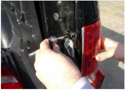
Step 9: Install the taillight in to the housing of the truck using the two 8mm. Screws.