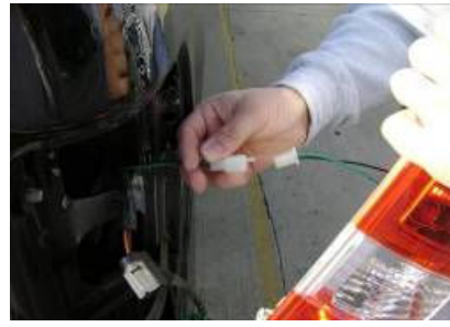
Step 8: Plug the resistor to the taillight.