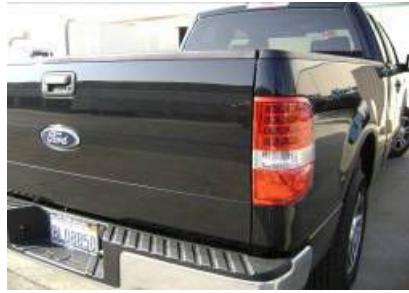
Step 10: Make sure all functions are working properly before driving.