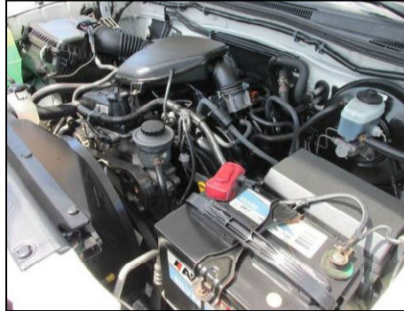
Open hood and disconnect negative battery cable.