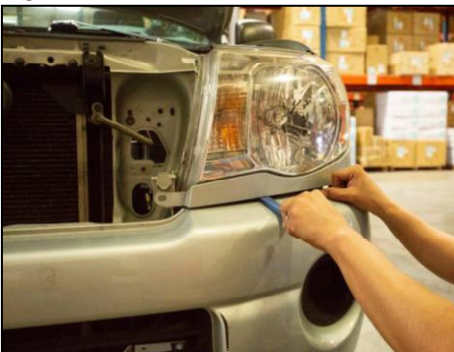
Use panel popper under headlight trim to release tab and remove trim. Repeat on other side.