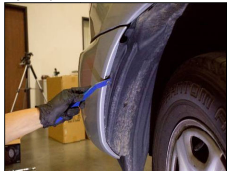
Remove lower push tab on inner fender well. Repeat on other side.