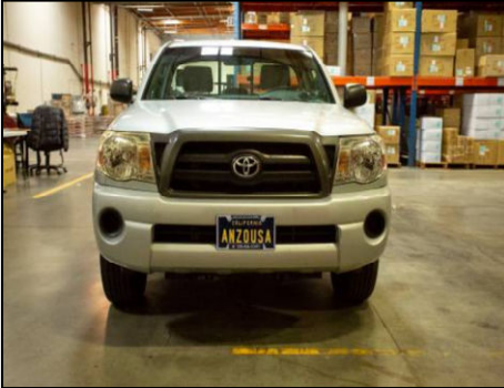
Stock Toyota Tacoma