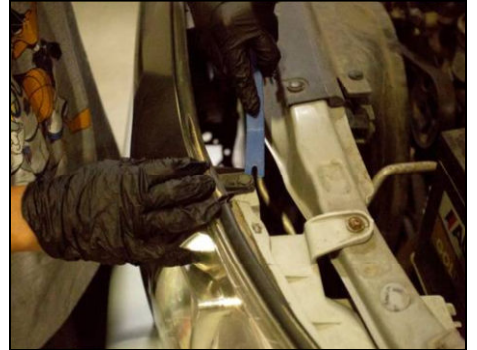
Remove 2 push tabs on top edge of grill.