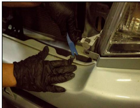
Remove 3 push tabs from top of bumper.