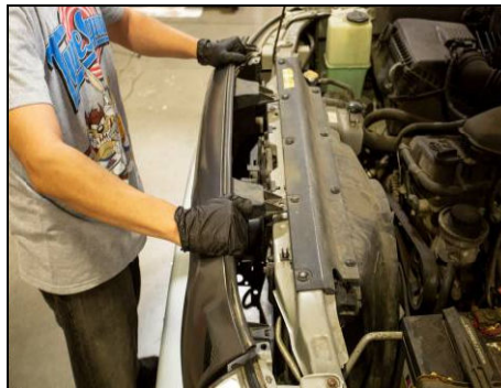
Pull up on radiator grill to pop out then remove and set grill aside.