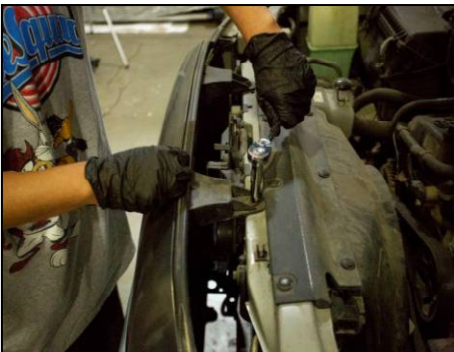
Remove two 10mm bolts from top of grill.