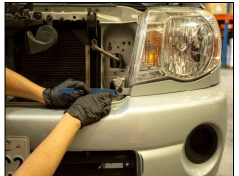
Remove push pin on headlight trim. Repeat on other side.