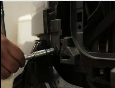
Remove 10mm bolt to remove headlight trim.