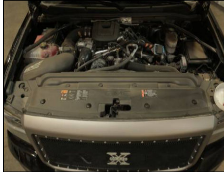
Open hood and disconnect negative battery cable.