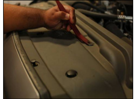
Remove 16 body clip tabs on radiator shroud.