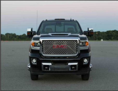
Factory stock headlights