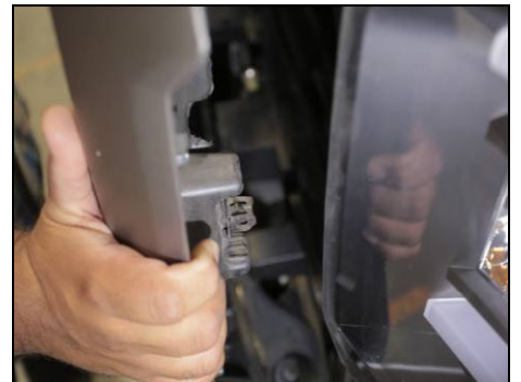
Hold each end of grill and pull to remove grill. Fasteners will be holding grill in place.