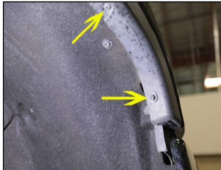
Remove T-10 Torx screw and 7mm bolt to unclip front of fender trim.