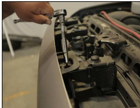
Remove four 10mm bolts from top of radiator grill.