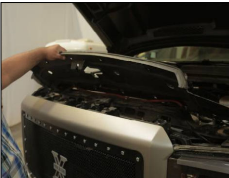
Remove radiator shroud and set aside.