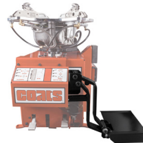
Point-of-Use Lift System (PN 85608609)