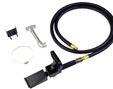
Auxiliary Bead Sealer (ABS) (PN 85606545)