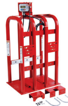
ELX Express Lane® Inflation System (PN 85607770)