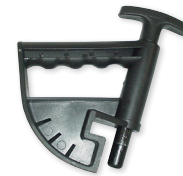
Manual Drop Center Tool (PN 8435685)