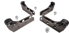
Grip-Max® Plus 28" Clamps (PN 85607986)