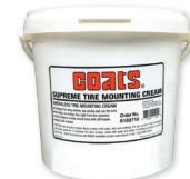
Paste Lube Bucket (PN 8183710)